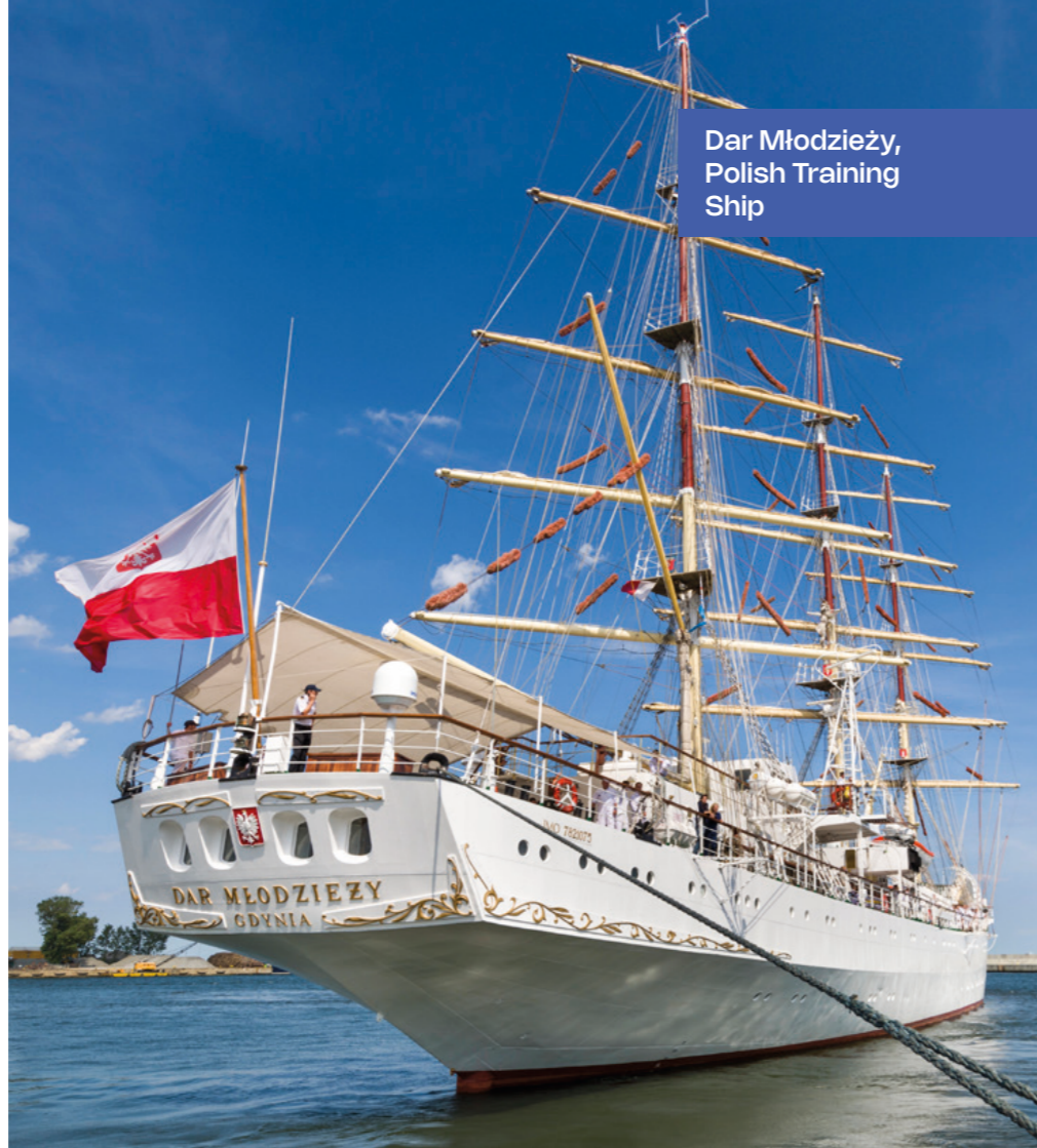
Dar Młodzieży, Polish Training Ship

Polish Naval Academy combines military and civilian education, offering programmes in both technical and humanities fields. From mechatronics to IT and logistics, AMW provides a comprehensive education that prepares students for service in the navy as well as successful civilian careers.