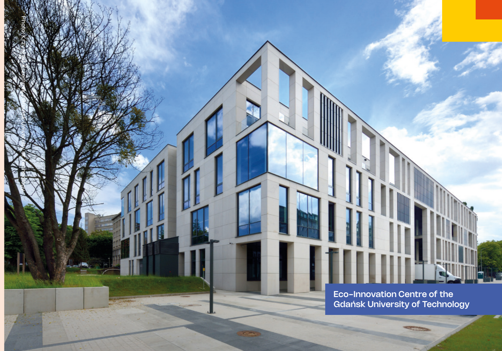
Eco-Innovation Centre of the Gdańsk University of Technology

Offshore Centre at Gdynia Maritime University operates in modern laboratories , giving you the chance to test innovative technologies, equipment, and simulators used in the offshore industry. Here you can conduct your own research , gain hands-on experience, and collaborate with industry experts. It's the perfect place to take your first step towards a successful career.