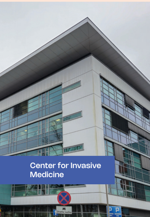
Center for Invasive Medicine

Medical University of Gdańsk is one of Poland's leading medical universities, recognised both nationally and internationally. With over 80 years of tradition combined with a modern approach to education, it stands out for its excellent academic staff and cutting-edge infrastructure. GUMed conducts world-class scientific, clinical, and research activities, significantly contributing to the progress of global medical science.